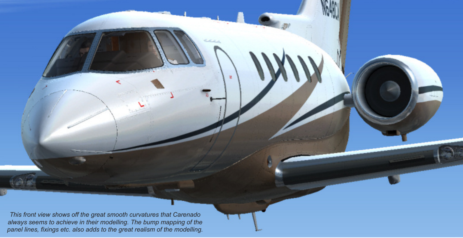
This front view shows off the great smooth curvatures that Carenado always seems to achieve in their modelling. The bump mapping of the panel lines, fixings etc. also adds to the great realism of the modelling.