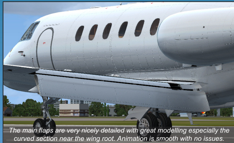
The main flaps are very nicely detailed with great modelling especially the curved section near the wing root. Animation is smooth with no issues.