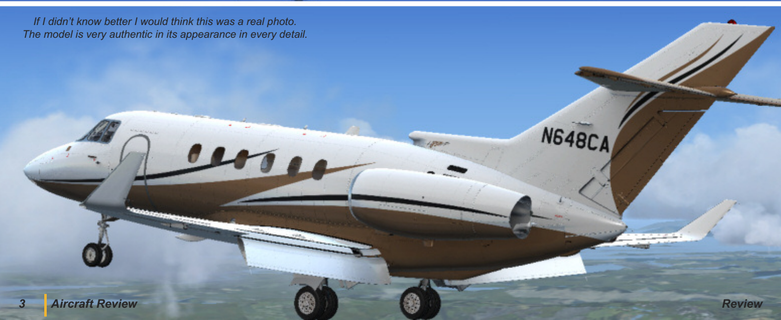
If I didn't know better I would think this was a real photo. The model is very authentic in its appearance in every detail.