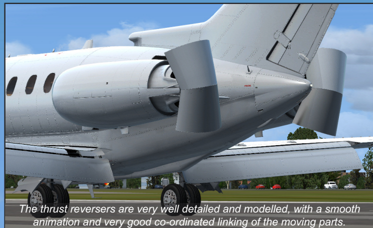
The thrust reversers are very well detailed and modelled, with a smooth animation and very good co-ordinated linking of the moving parts.