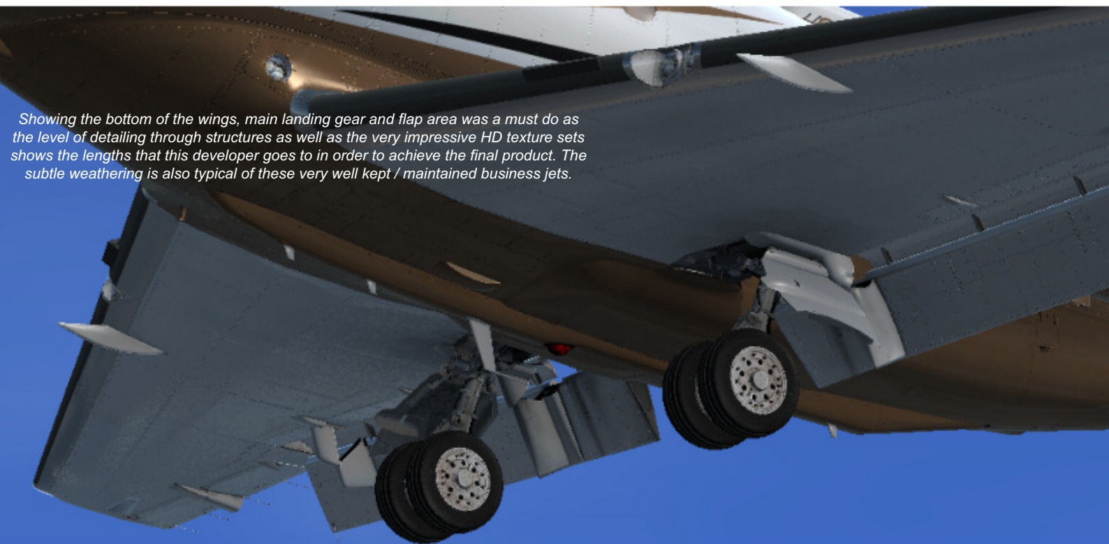
Showing the bottom of the wings, main landing gear and flap area was a must do as the level of detailing through structures as well as the very impressive HD texture sets shows the lengths that this developer goes to in order to achieve the final product. The subtle weathering is also typical of these very well kept / maintained business jets.