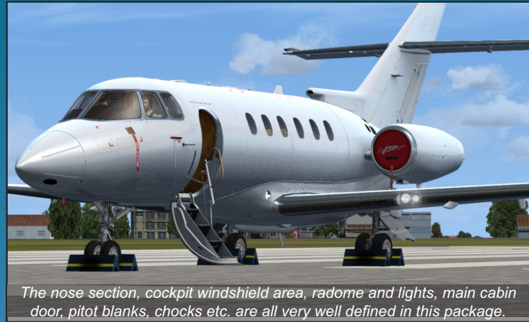
The nose section, cockpit windshield area, radome and lights, main cabin door, pitot blanks, chocks etc. are all very well defined in this package.

The displays on the panel are very easy to read with clear fonts on the PFD / MFD's and crisp dials on the AOA indicators / brake pressure gauge which have good depth between the bezel glass and dial plates.