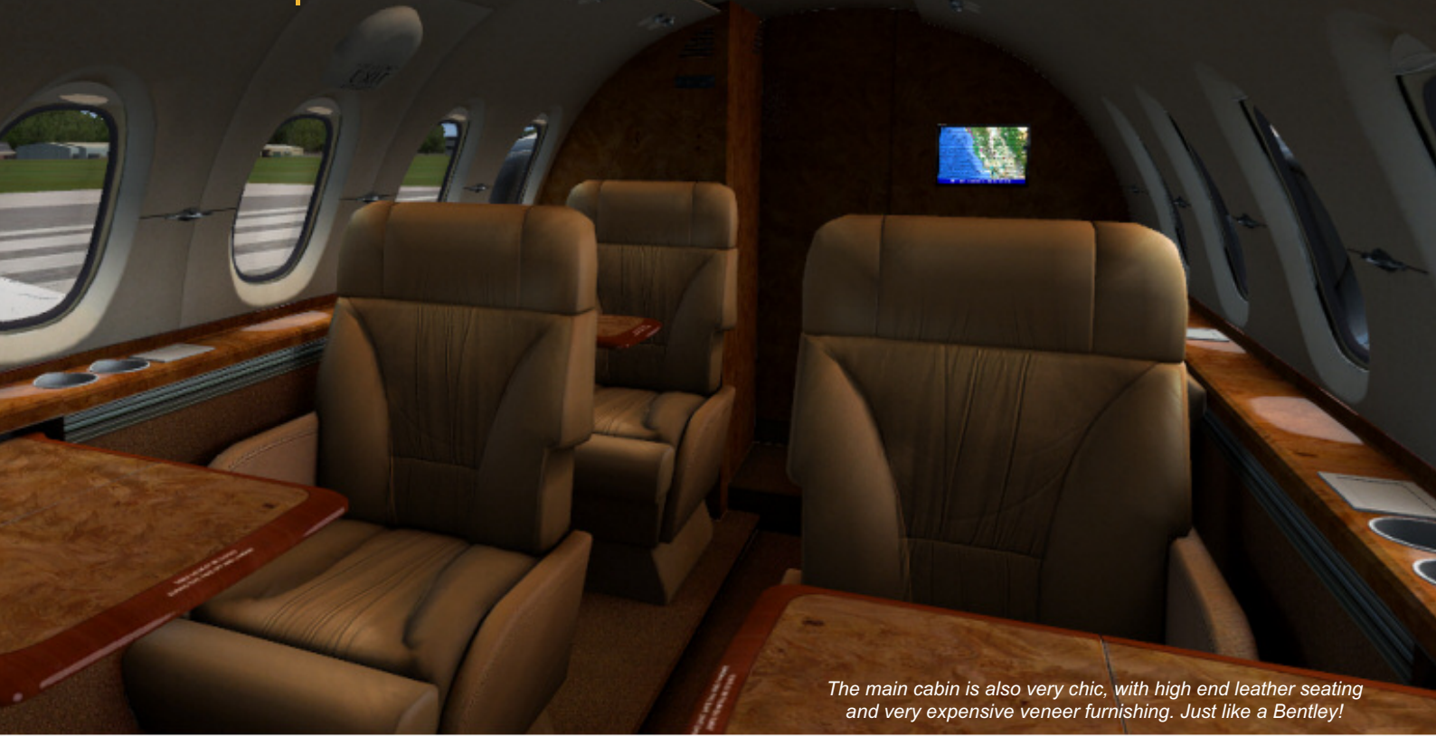
The main cabin is also very chic, with high end leather seating and very expensive veneer furnishing. Just like a Bentley!